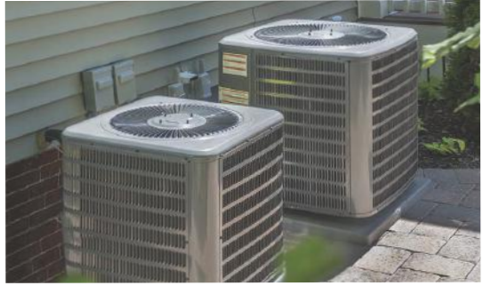
**Coolant not included in plan and is billed separately.