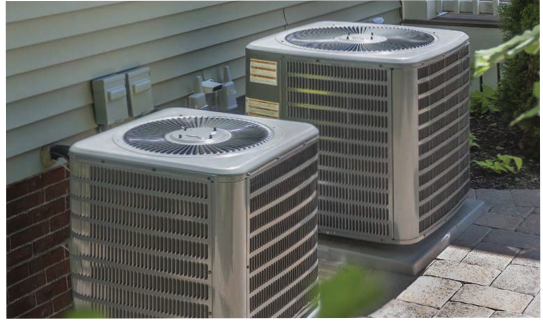
**Coolant not included in plan and is billed separately.